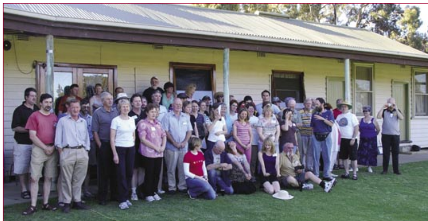
Some of the more than 90 attendees of this wonderful star party.